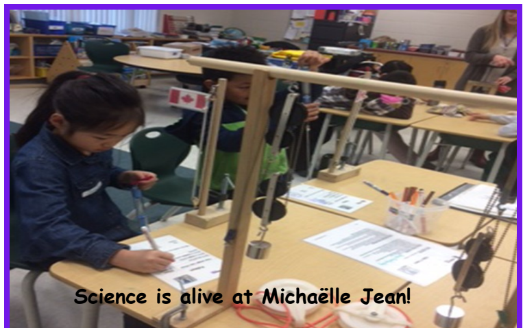
Science is alive at Michaëlle Jean!

Thank you to our wonderful volunteers for providing Pizza Lunches for our students. Much appreciated!